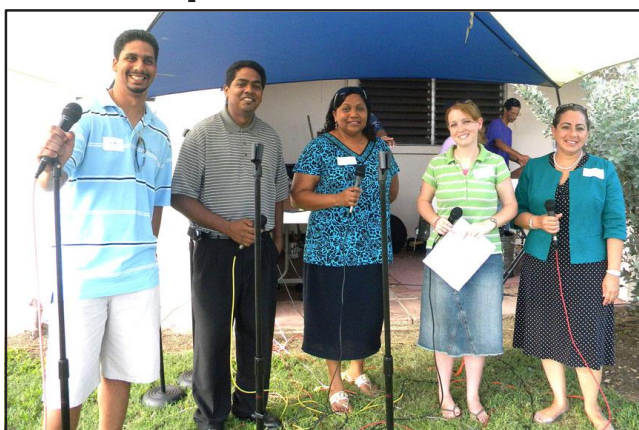
The Free Will Praise Team provided great music for the event.