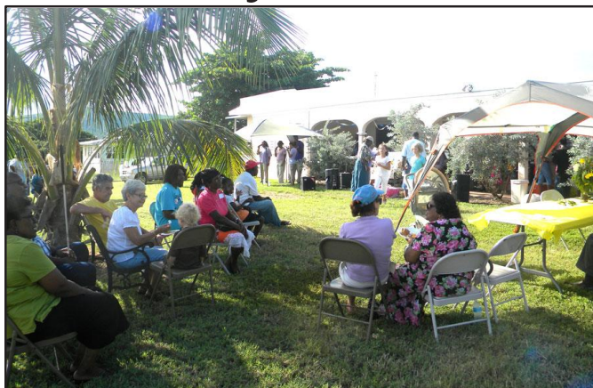
A lot of guests enjoyed the great fellowship at WIVH's Open House