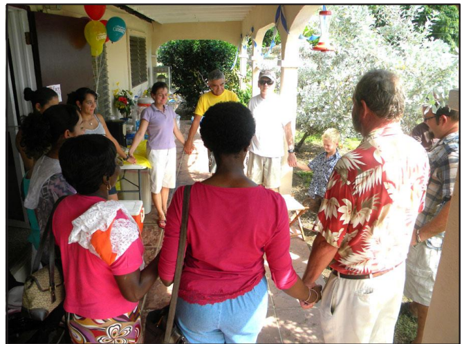
Guests join hands for the opening prayer.