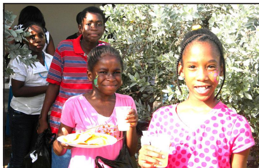
The children enjoyed face painting and, of course, the delicious food.